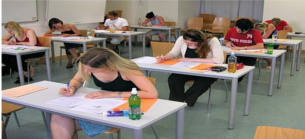
NO SILVER BULLET: Stoke-on-Trent has the worst record in the UK for people leaving school without qualifications.

By The Sentinel | Posted: January 25, 2016